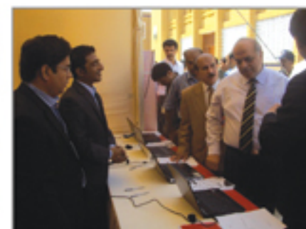
New Horizon Team demonstrating HP Notebooks to LUMHS faculty members